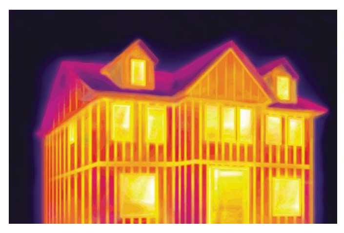
Before OSB and R-13 batts